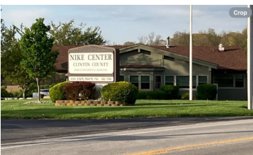
Honoring Our Past

I am fully aware that this is a huge change for all. It is vital as we move forward that we honor the past and embrace the future. As always, we will be here at your Board of Developmental Disabilities as needs arise. Regardless of location, that will never change.