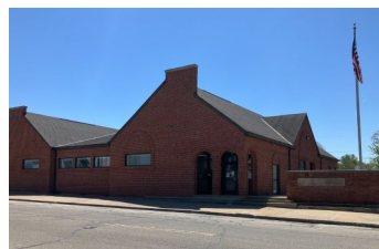
Embracing Our Future